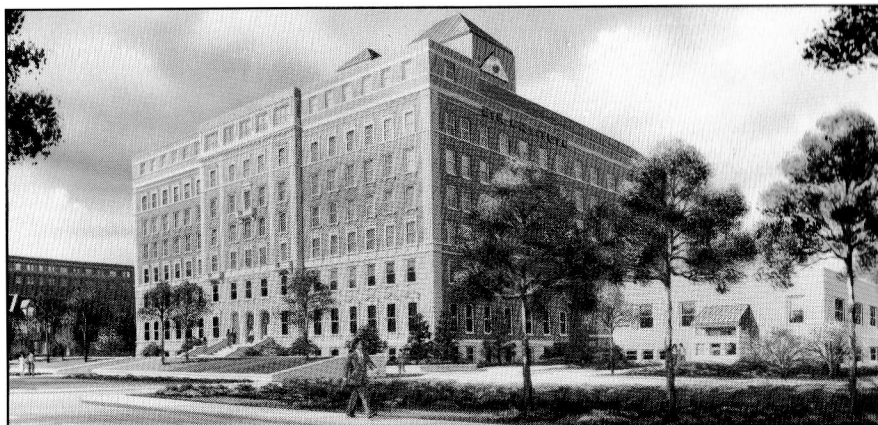
The Eye Institute—1755 S. Grand Boulevard